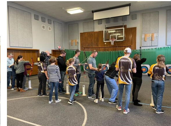
Below: The first Centershot league finished up by teaming up with Waynedale Archery for an Easter Classic in the WUMC gym.