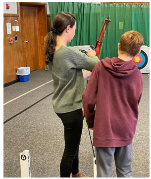
Above & Left: Archery students instruct their parents on the archery techniques they have learned.