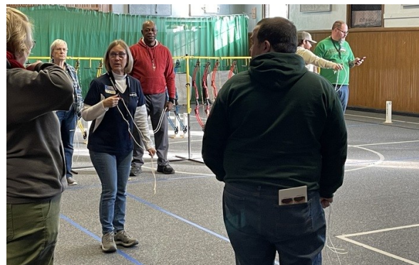
Below: A regional Centershot training event was held in the WUMC gym.