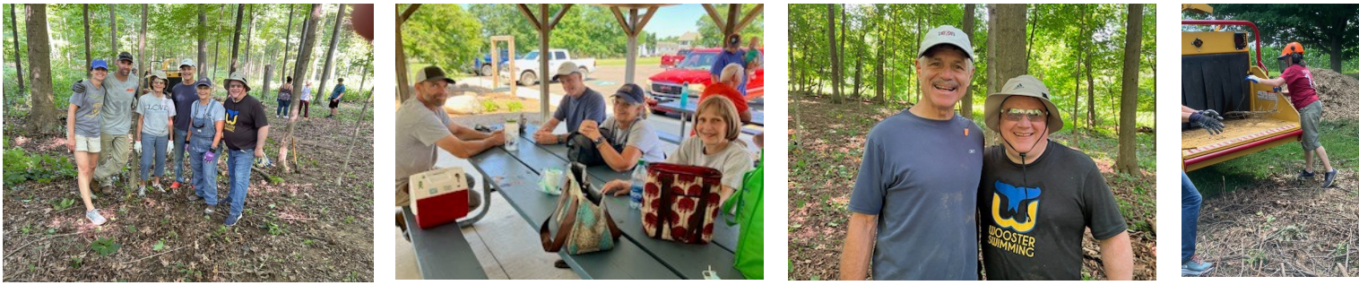
Above & Right: A mission team from WUMC worked at Christian Children's Home of Ohio clearing pathways for use by CCHO residents.