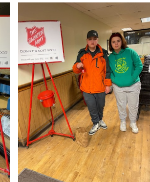
Left: WUMC members ring the bells for the Salvation Army.