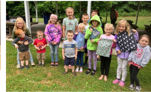
Above: A special thank you to the Lappers group for sewing 40+ book bags for the Fredericksburg Community Library's Summer Reading kiddos!! Here are just a few of the happy recipients!