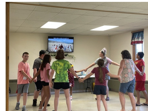
Below: WUMC participated in a combined area UMC VBS with a "Babylon: Daniels Courage in Captivity" theme.