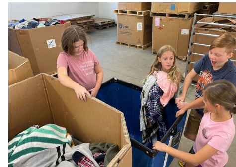
Above: Youth serve at Goodwill & enjoy lunch together.