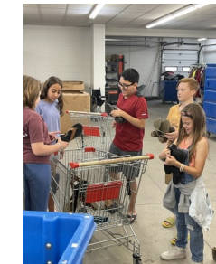
Left: Youth mission day at Wooster Goodwill.