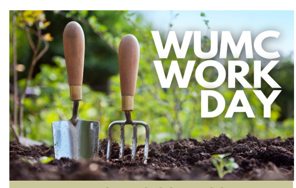
May 6 · 8:00-11:30a

Canal District Spring Conference 2023 will meet on Saturday, May 13 at Centenary UMC in Akron. Times and additional details available soon.