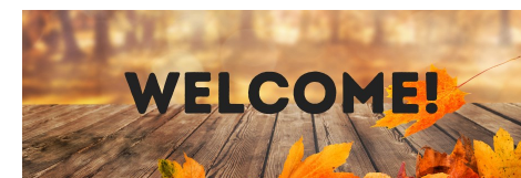
Right: WUMC welcomed the following new members during our worship service on October 29: