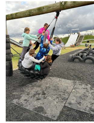
Left: family fun at Ramseyer Farm.