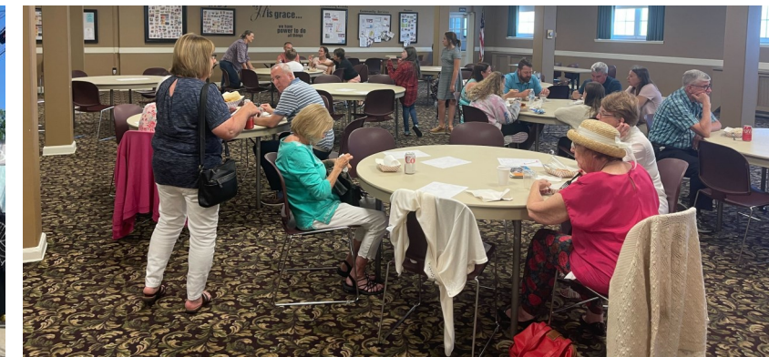
Above: Folks enjoyed brunch from the Rolling Leaf food truck as a wrap-up to our "Food Truck Party" Sunday school curriculum!