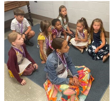
Left and above: Games and stories were part of the summertime "Food Truck Party" Sunday school curriculum! Older students and adult teachers provided leadership.