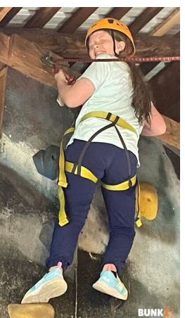
Above, left, right: WUMC kids at Camp