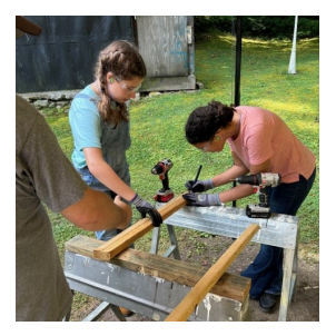
Above, left, right: The WUMC Appalachian Service Project Mission Team at work and play, and with their finished project!