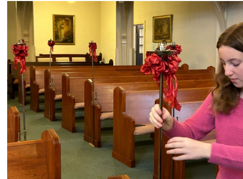
Left, Above and Below: Hanging of the Greens to prepare for Christmas.