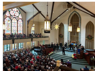
Above: WUMC welcomed 400 people to the Burning River Brass concert—and $2300 was raised for the Salvation Army!