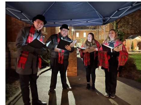
Above: The Cleveland Carolers entertain the crowd at the Historic Church Tour.