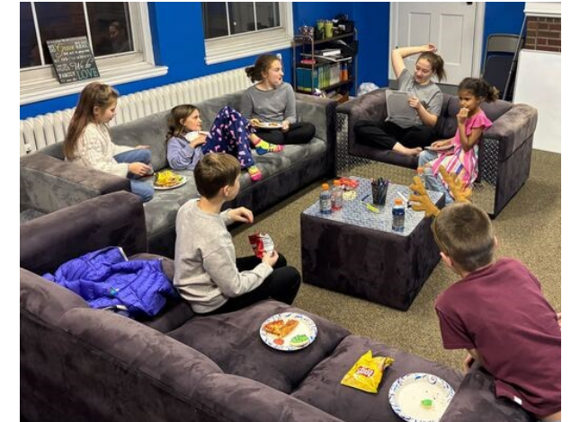
Above: WUMC parents enjoyed a free evening as WUMC youth planned activities for the kiddos at Parents Night Out!