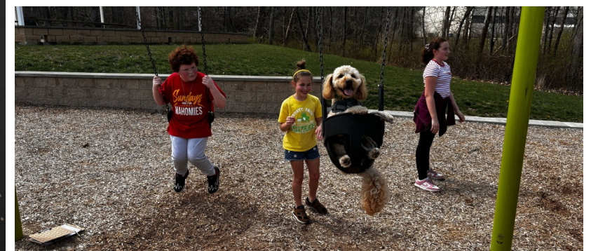
Below: Play time for kids and pups following the Good Friday Nature Walk.