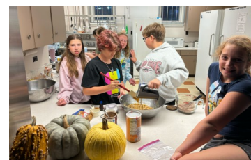
Above: WUMC youth prepare for a Bake Sale to raise money for missions and camp.