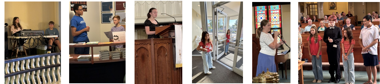
Above: WUMC youth participate in all aspects of Sunday services.